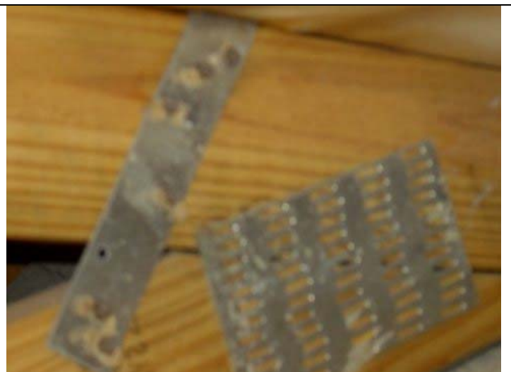
Roof to wall attachment