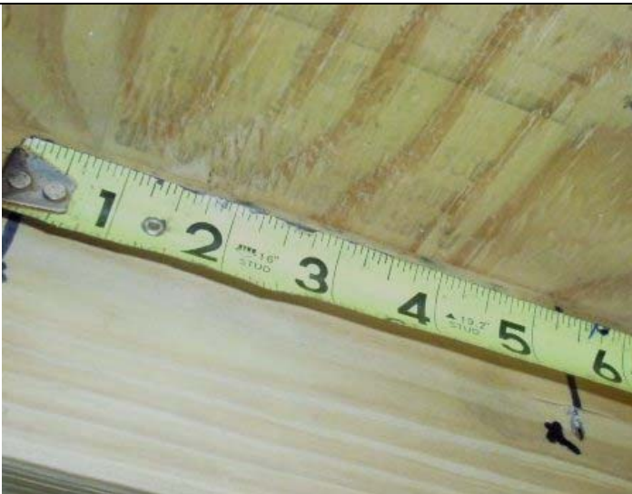
Roof deck attachment