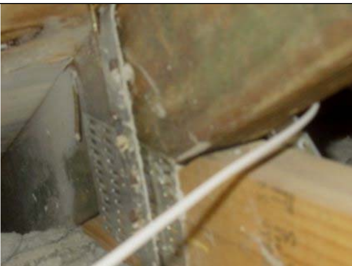
Roof to wall attachment