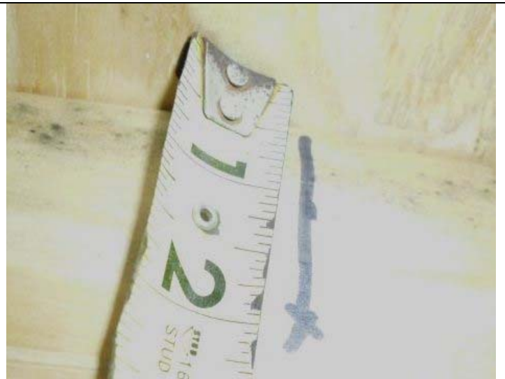
Roof deck attachment